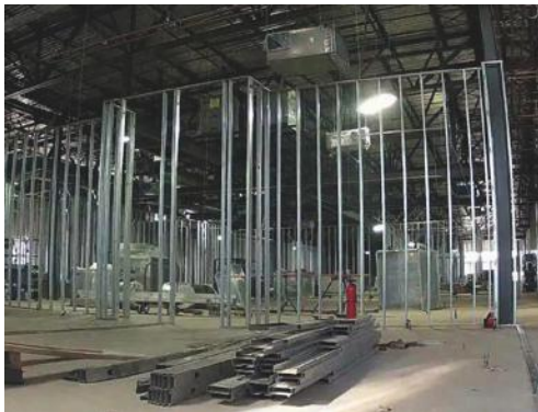
Typical studwork construction to accommodate DYNAMIK Internal Walling which eliminates the need for blockwork and other wet trades.

The intended method of installation would be to fix sheeting rails across the structural steels to which vertical/horizontal studwork and subsequently panels would be attached using supplied secret fixing clips.