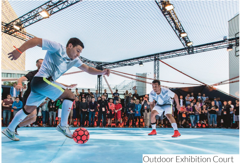
Outdoor Exhibition Court