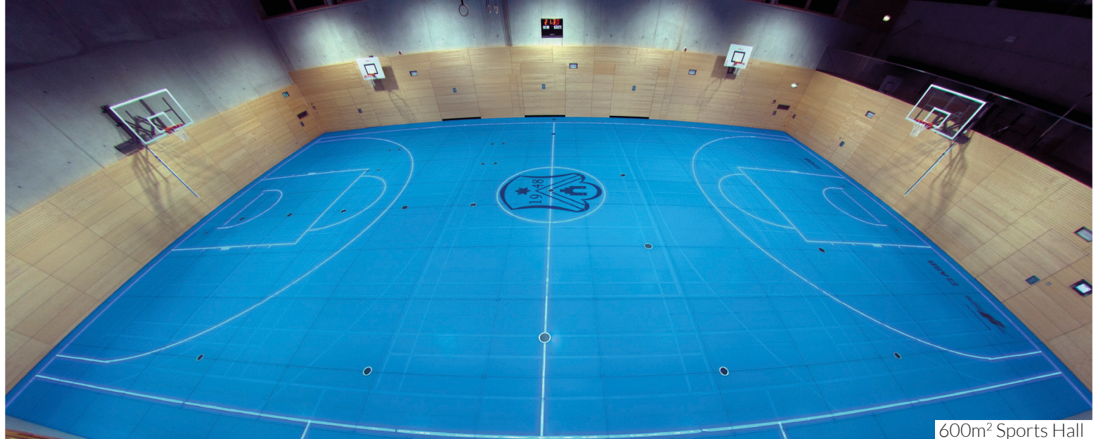
600m 2 Sports Hall