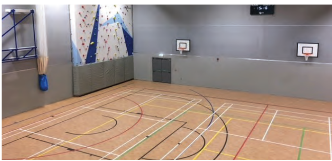
DYNAMIK A4 AREA ELASTIC SPRUNG FLOOR FINISHED IN SPORTS VINYL AS INSTALLED AT BADMINTON SCHOOL

There are considerations that sometimes are not made clear to the end user. For example, current requirements from the Education & Skills Funding Agency (ESFA) state that activity spaces, such as those used for sport, must now be sprung A3 or A4 area elastic floors. A foam-backed vinyl is a point elastic floor (P1, P2 or P3) and as such would not meet the current ESFA specification or guidance.