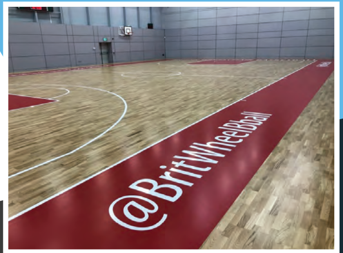
DYNAMIK SPRUNG OAK FLOOR AT BWB TRAINING VENUE

Sprung wooden floors provide wheelchair users with ideal rolling resistance, not allowing chair castors to sink into a soft foam backing. Spongy foam backed surfaces may contribute to stress injuries and fatigue, affecting all levels of wheelchair usage, therefore a surface with a low rolling resistance is the official requirement of BWB when choosing a venue or supporting a project where questions of suitability of surfaces require guidance or support.