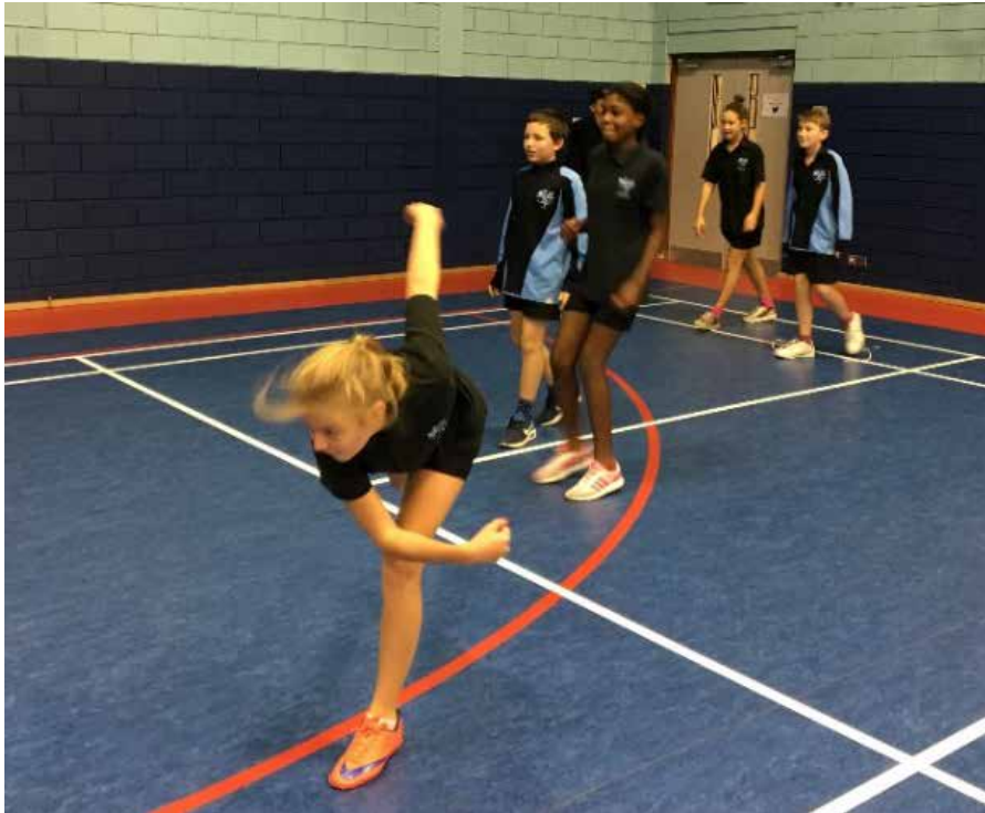
DYNAMIK A4 Sprung Floor