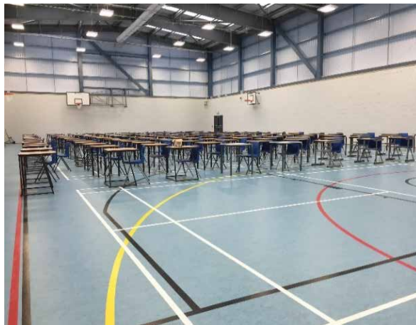
DYNAMIK A4 area elastic sprung system finished in a solid synthetic surface ideal for use without floor protection

Current considerations when choosing a new sports floor include: initial cost, performance characteristics, durability, sporting and non-sporting usage such as examinations, comfort levels, compliance with The Equality Act 2010, floor protection for hardwood surfaces to avoid scratch or indentation damage, life-cycle costs, maintenance, rolling and point load resistance.