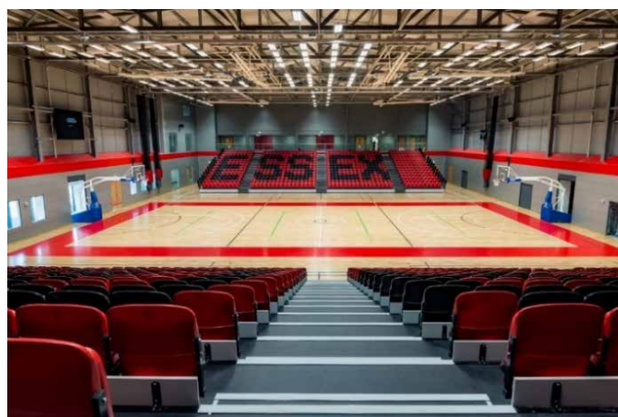
DYNAMIK Sprung A4 System with Retractable Seating

A3 or A4 area elastic sprung systems typically offer high indentation resistance and can withstand high rolling loads from retractable seating or sports equipment, as well as being ideal for non-sporting usage such as school events or community use. The ESFA's latest specification also details a minimum requirement for larger educational establishments (over 900 students) to provide retractable seating therefore sprung systems need to be finished with a solid playing surface such as timber, solid vinyl, solid linoleum or non-pad based seamless PU.