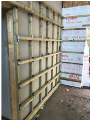
Typical studwork construction to accommodate DYNAMIK Internal Walling

DYNAMIK panels provide a fast and efficient internal sports walling solution, manufactured from engineered timber. It can be installed as an independent wall system when combined with structured SFS or timber studwork. This eliminates the need for blockwork and other wet trades.