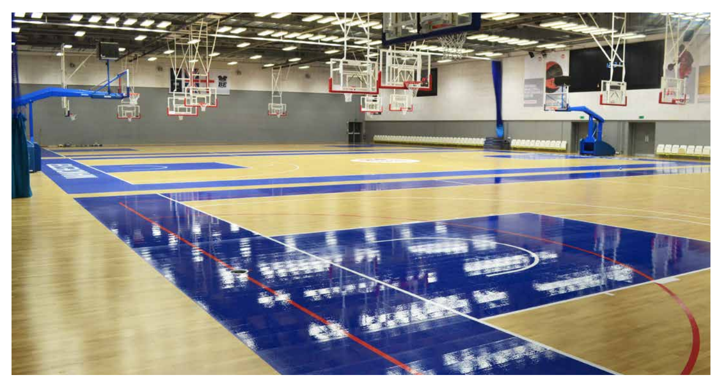
A DYNAMIK Sports Floor installed at the National Basketball Performance Centre (NBPC), Manchester.

Wood floors have evolved such that if your preference is for a hardwood finish then a DYNAMIK engineered Premium Sports Oak board should be the obvious choice – superior sports performance and lower life cycle costs come as standard.