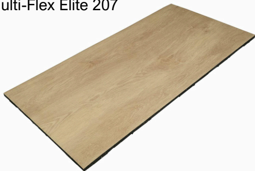
Multi-Flex Elite 207