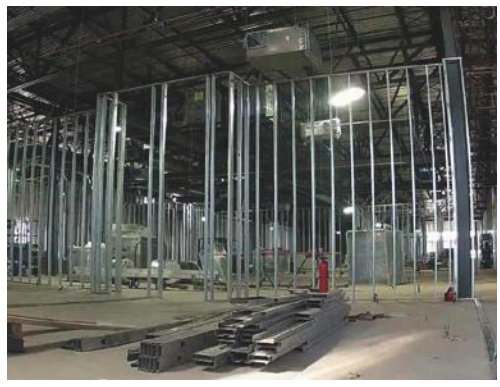
Typical studwork construction to accommodate DYNAMIK Internal Walling which eliminates the need for blockwork and other wet trades.

The intended method of installation would be to fix sheeting rails across the structural steels to which vertical/horizontal studwork and subsequently panels would be attached using supplied secret fixing clips.